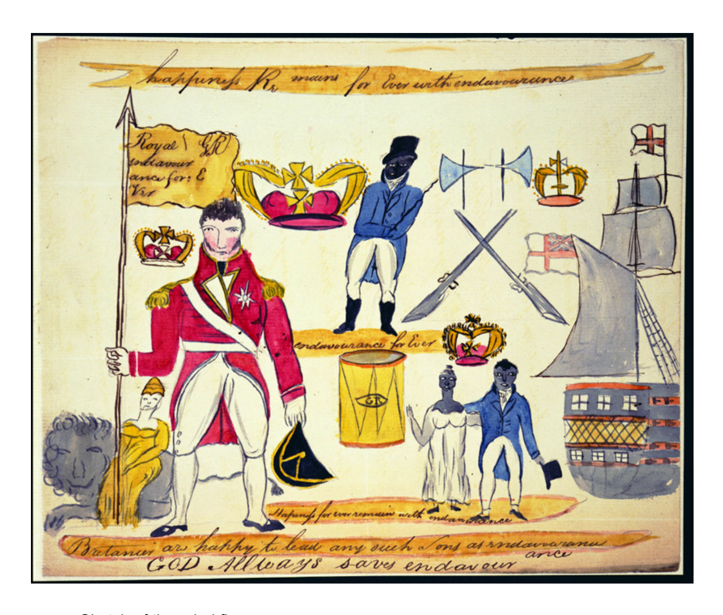
Sketch of the rebel flag Housed in the British National Archives (MFQ 1/112)