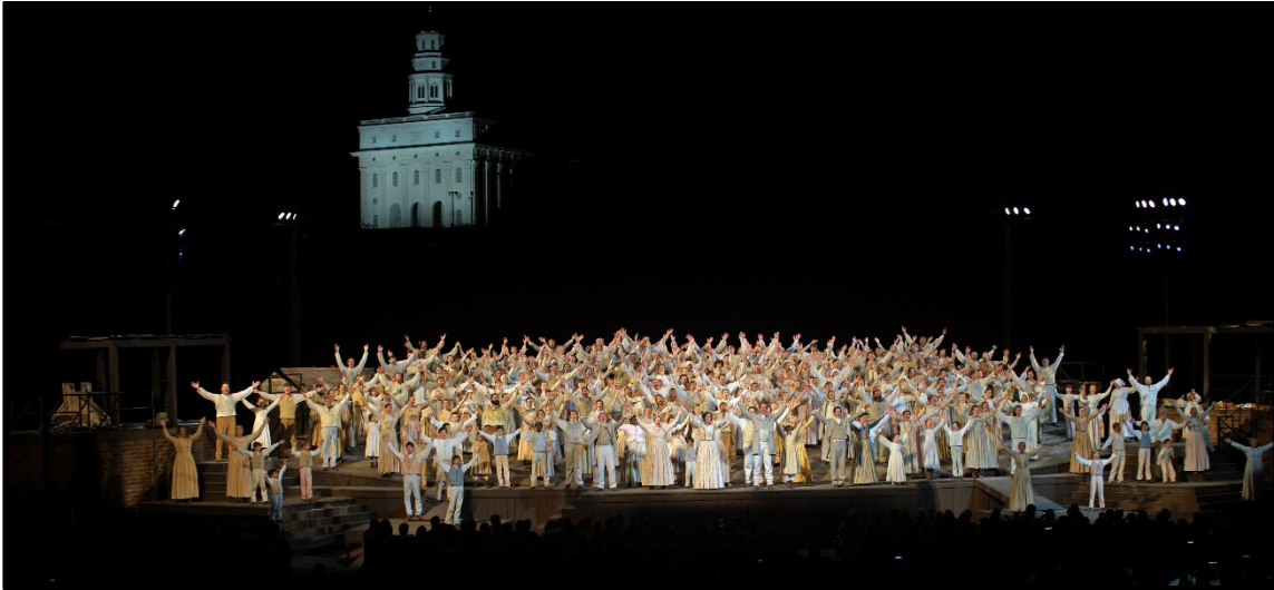
(Fig. 1. The Nauvoo Pageant finale, Nauvoo, Illinois, from: Franklin, Kyle. 9 July 2019. Used with permission.)

And The British Pageant in Chorley, Lancashire is staged on the Preston Temple grounds. As such these edifices - so sacred to Latter-day Saints - become an intrinsic part of the site-specific performances studied, with impact for cast and audiences alike, as discussed in depth in Chapter Four in relation to faithscape.