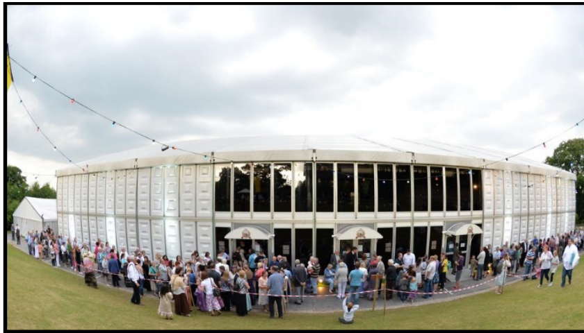
(Fig. 3. The British Pageant performance venue, Chorley, Lancashire )

holding 1800 people a night for the pageant, “it became a tabernacle to us, a holy place where saints from all over the British Isles had gathered to worship the Lord” (Cook).