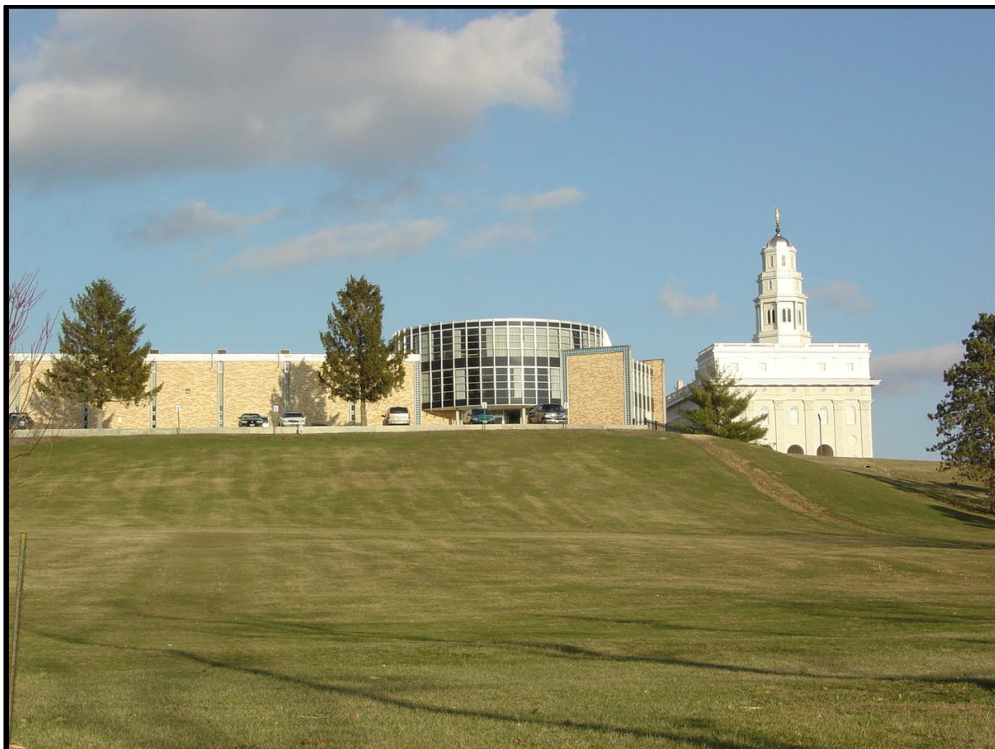
(Fig. 7. The Joseph Smith Academy as was, Nauvoo, Illinois. Mays, Kenneth. Picturing history: Joseph Smith Academy in Nauvoo, Illinois , Deseret News, 2 Aug 2017, www.deseret.com/2017/8/2/20616848/picturing-history-joseph-smith-academy-in-nauvoo-illinois#a-view-of-the-joseph-smith-academy-building-in-front-of-the-nauvoo-temple-in-2003 )

The original creator and director of The Nauvoo Pageant once shared in a pre-show cast meeting that the most inspiring moment for him all evening was not actually within the pageant itself, but rather seeing all the cast, in costume, walk down the hill or “bluff” as it is called in Nauvoo, towards the stage to get ready to perform the show that night (Warner “Keynote speaker”). He shared this insight in a building called the Joseph Smith Academy. That building is shown below (fig. 7) on the left hand side of the image, with the re-built Nauvoo Temple in white on the right hand side, and the rolling green bluff that leads to the stage, which is about a five-minute walk from the Joseph Smith Academy.