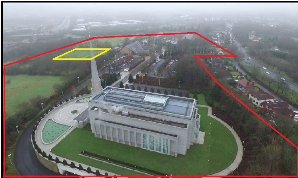
(Fig. 13. Preston Temple grounds, an aerial view, Chorley, Lancashire from: Melling, John. Preston / Chorley Mormon LDS Temple , YouTube, 8 Jan. 2017, lines added, www.youtube.com/watch?v=BQeCNJKahnl .)

Though The British Pageant in the UK is being staged on the same complex as The Preston Temple, the results of that site-specific choice play out quite differently than The Nauvoo Pageant being staged near the temple there, and whilst faithscape within the landscape still functions in Chorley, it does so in a different way. In Nauvoo, as discussed above, faithscape is revealed in and through the material manifestations of labour, the taskscape, of roads, houses, trees planted, the temple and more, including the permanent pageant stage and lighting towers. At the Preston Temple site in Chorley, Lancashire, faithscape functions on two levels; first, the material manifestations of labour, and second in the people gathering to the pageant, and these two levels of faithscape are actually connected.