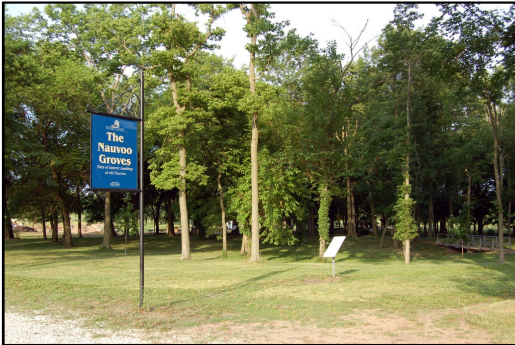
(Fig. 12. A grove of trees, bordering the audience, Nauvoo, Illinois from: Mays, Kenneth. Picturing history: The groves in Nauvoo, Illinois , Deseret News, 16 Jan. 2019, www.deseret.com/2019/1/16/20663467/picturing-history-the-groves-in-nauvoo-illinois#a-site-in-nauvoo-2006-representative-of-the-groves-where-the-saints-would-meet-to-hear-from-leaders )

“grove” with a blue signpost pointing out that Joseph Smith often preached in this very grove, and others like it, in Nauvoo. An image of the grove, located just to the left of the audience as they watch the shows, is shown below (fig. 12). (Indeed, some digging for pageant-related activities can be seen just through the trees in the lower left hand side of this image.)