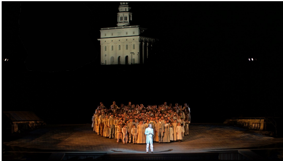
(Fig. 5. The Nauvoo Pageant finale, grouped together from: Franklin, Kyle. 9 July 2019.)