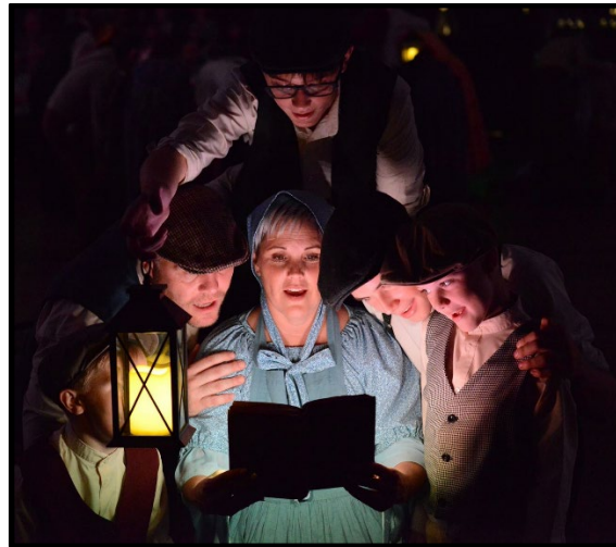
(Fig. 14. The British Pageant , a family reading from the Bible in English from: Brophy, Nicola. Aug. 2017.)

embedded in them, representing the “light” of God’s word as it becomes available to the people, as the image below (fig. 14) from performance reveals.