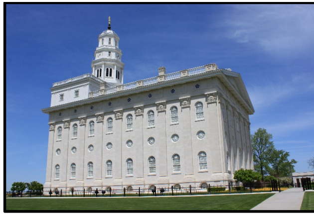
(Fig. 11. Present Nauvoo Temple, built 2002, from: Nauvoo Illinois Temple , Additional Resource, Newsroom, The Church of Jesus Christ of Latter-day Saints, newsroom.churchofjesuschrist.org/article/nauvoo-illinois-temple )