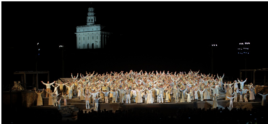
(Fig. 6. The Nauvoo Pageant finale, from: Franklin, Kyle. 9 July 2019.)

The British Pageant in Nauvoo shares some similarities in its ending, (though many differences) but for the purposes of this conclusion it is enough to appreciate that there is no gathering into one large group, but rather into several smaller family groups on stage, before splitting as individuals to fill the whole stage, as in the The Nauvoo Pageant picture, above, and the temple is not lit up. What becomes apparent, especially from the photo immediately above, is that in The Nauvoo Pageant the audience are invited to make connections and meaning between the brightly lit Nauvoo Temple and the brightly lit cast members. The scenographic space between the two images – the temple and the cast members - becomes theologically inscribed in the process. Firstly, the