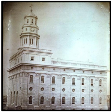
(Fig. 10. Original Nauvoo Temple, built 1846, from: Iron County Company Daughters of Utah Pioneers. Early Images of Historic Nauvoo, The House of the Lord, The Nauvoo Temple , Church History, The Church of Jesus Christ of Latter-day Saints, history.churchofjesuschrist.org/exhibit/early-images-of-historic-nauvoo?lang=eng#mv8 )