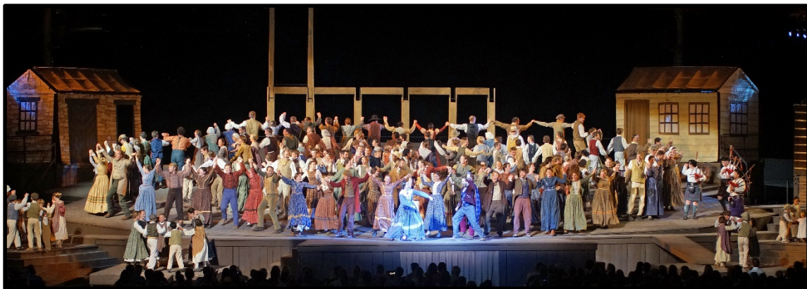
(Fig. 4. The Nauvoo Pageant Evening Dance circular finale, Nauvoo, Illinois)

outer circle about sixty people. With cast members holding hands, the circles move in opposite directions, hands being raised and lowered together on counts of four, as the cast dance for about twelve counts total in these concentric circles. Inasmuch as the stage is quite a steep rake in Nauvoo, you can actually see these four circles quite clearly, especially the further back you sit. The picture below (fig. 4) gives a visual sense of what I have just described.