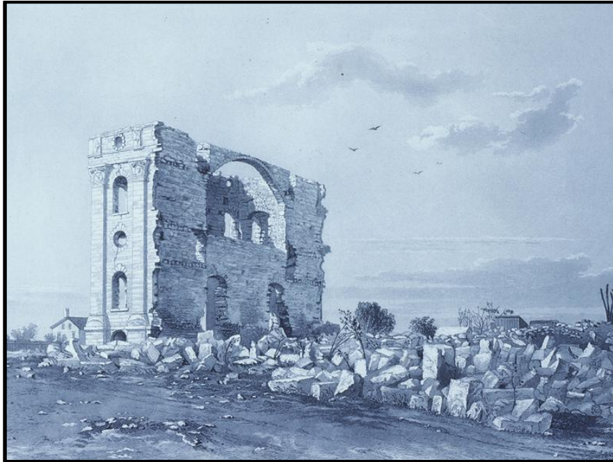
(Fig. 9. Ruins after destruction of the Nauvoo Temple, Illinois from: The Nauvoo Temple: Destruction and Rebirth , Museum Treasures, Church History, The Church of Jesus Christ of Latter-day Saints, 14 Jan. 2015, history.lds.org/article/museum-treasures-nauvoo-temple-in-ruins-lithograph?lang=eng )

For safety the front façade was also knocked down and the stones used. Within a few years, there were little visible remains left of the once magnificent religious edifice.